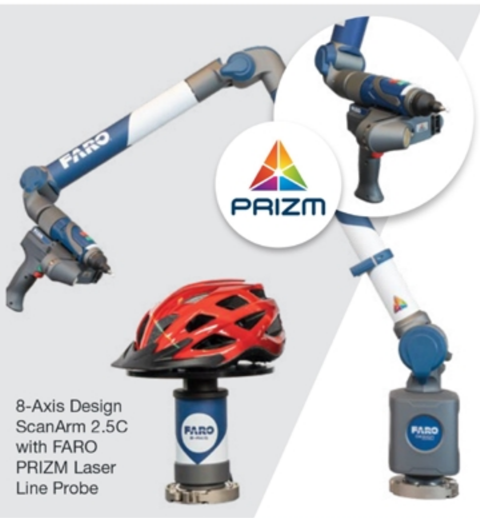
8-Axis Design ScanArm 2.5C with FARO PRIZM Laser Line Probe

The 8-Axis Design ScanArm 2.5C is the ideal solution for any organization that may have the need to develop or manufacture parts and after-market products characterized by different coatings, materials, co-molded parts or surfaced finishes without existing CAD models. Users can also reverse engineer legacy parts to design changes or replacement, create digital libraries to decrease inventory and warehouse costs, design aesthetically pleasing free form surfaces or leverage the power of rapid prototyping.